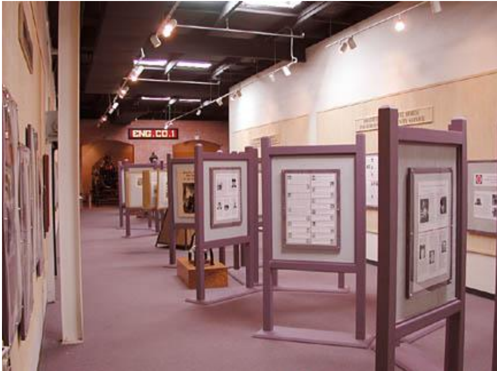
The Hall of Heroes