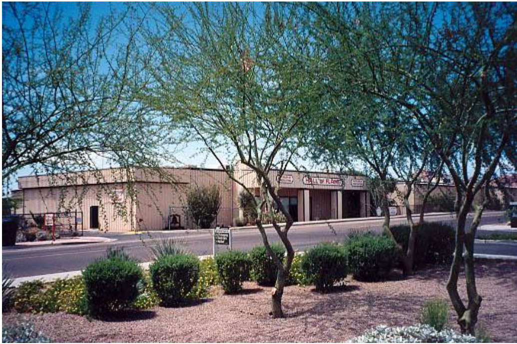
The Hall of Flame building, Phoenix, AZ