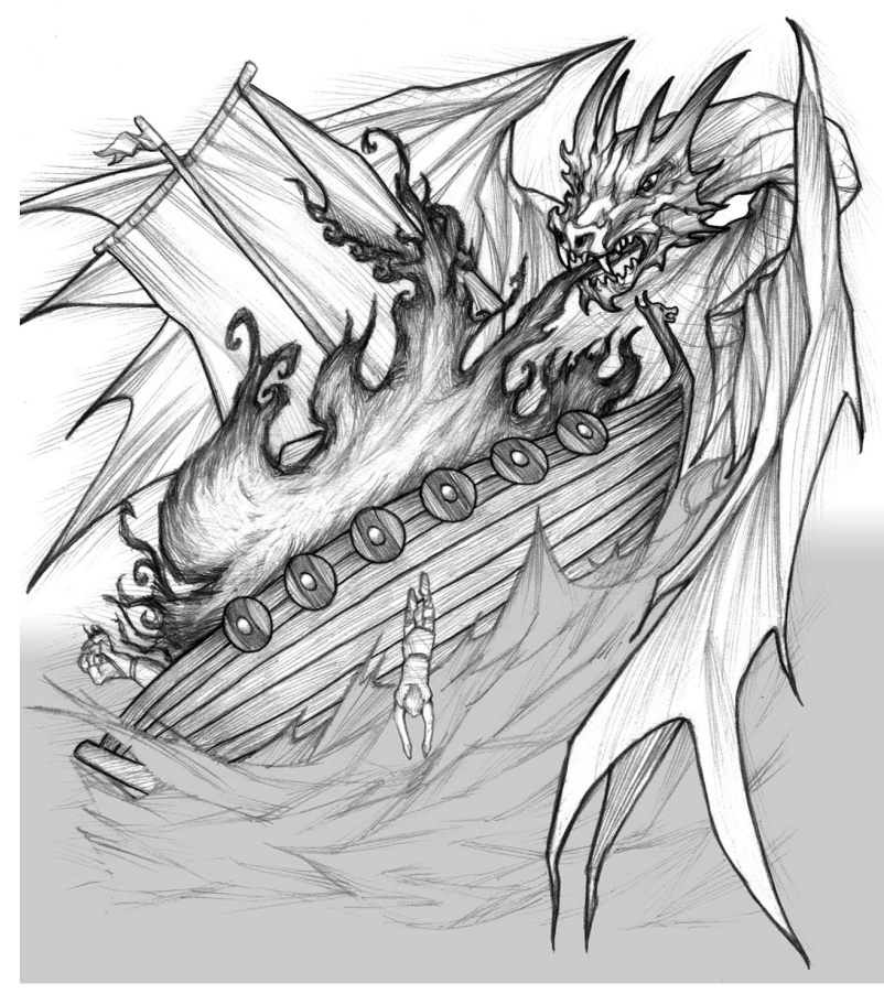
Illustration by Grey Thornberry

In 1224 a magus from Loch Leglean investigates the haunting and meets Hadrianus's ghost. Hadrianus gives an incoherent account of the battle, but makes it clear that he was slain by forces summoned by the Order of Odin. Having delivered this message his spirit rests. An