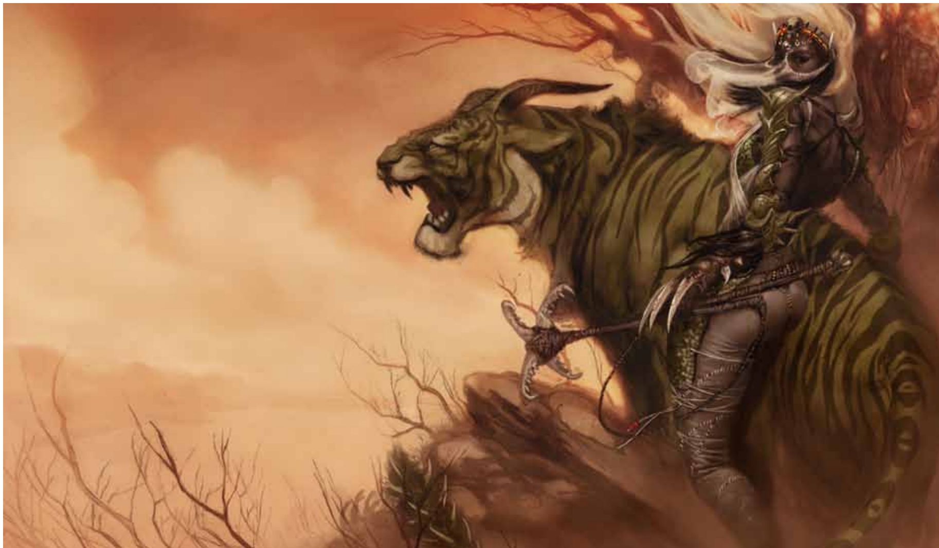
Illustration by Brian Valenzuela