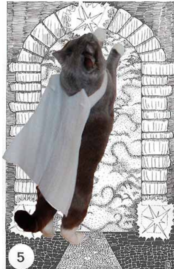
5 Monster (with Omega Tech cape), operating the Misty Archway

of debris that was once Whiskers. It did not look any more promising.