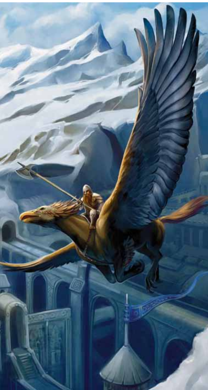
Illustration by Eva Widemann

In many realms and kingdoms, the mounted warrior stands at the apex of military effectiveness. Human knights riding heavily armored warhorses smash orc hordes in overwhelming massed charges; eladrin cavalry sweep through an enemy's flanks, swords flashing in the starlight; goblin wolfriders bound across the battlefield, rending foes with fang and spear; mighty archmages soar over teeming armies on the vast leathery wings of manticores, wyverns, or dragons, raining down destruction from above. No one can deny that the combination of skilled rider and powerful steed is almost irresistible in battle. Any hero can fight effectively from nearly any mount, but a few characters stand out as the masters of mounted combat. The knight is famed for skill in mounted combat, while the cavalier is renowned for his or her steed, charger, or warhorse—a loyal companion and ally touched by the divine favor that follows any paladin in battle.