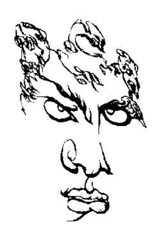
first published in FORM MAGAZINE Vol. 1 No. 1, April 1916

By this means sensation may be visualized.