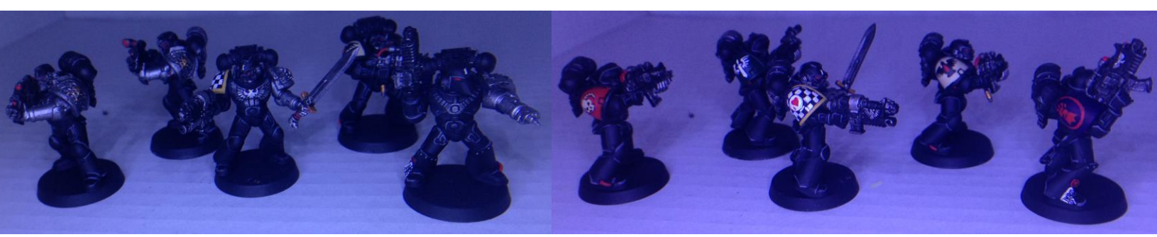
A Deathwatch Kill Team, the standard unit used in operations of the Deathwatch. Armed with Stalker Pattern Bolters, the Sergeant has a Power Sword and a Combi-Grav Gun. Truly prepared for any encounter.