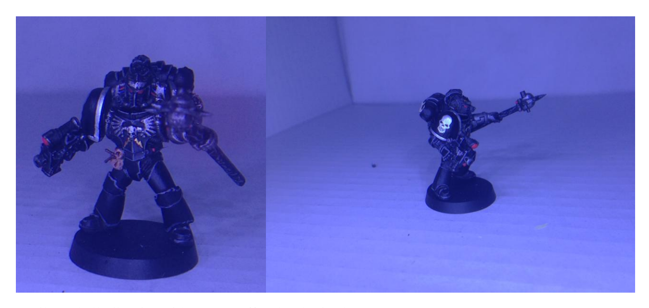
Silver Skull Librarian with Force Staff and Bolt Pistol