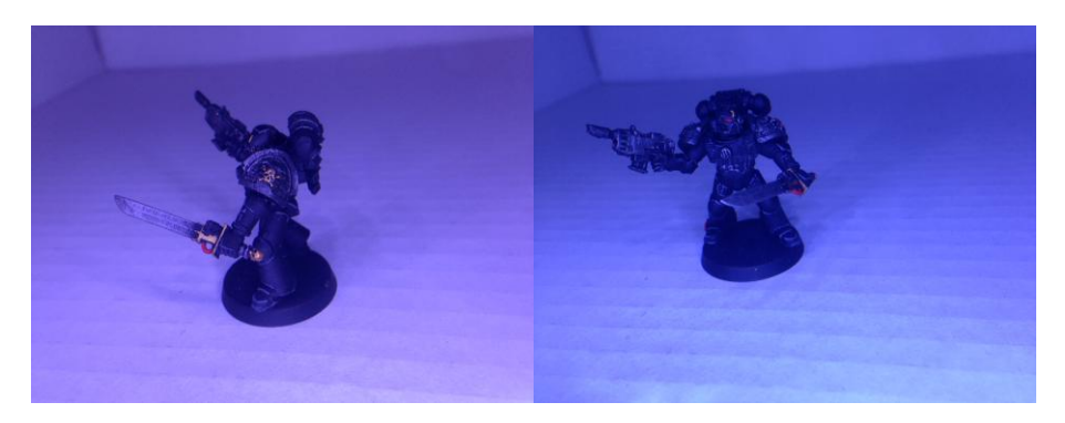
Deathwatch Ordo Xenos Inquisitor with Needle Pistol and Power Sword

All models in this section have been purchased, assembled, and painted by Christopher Quillinan.