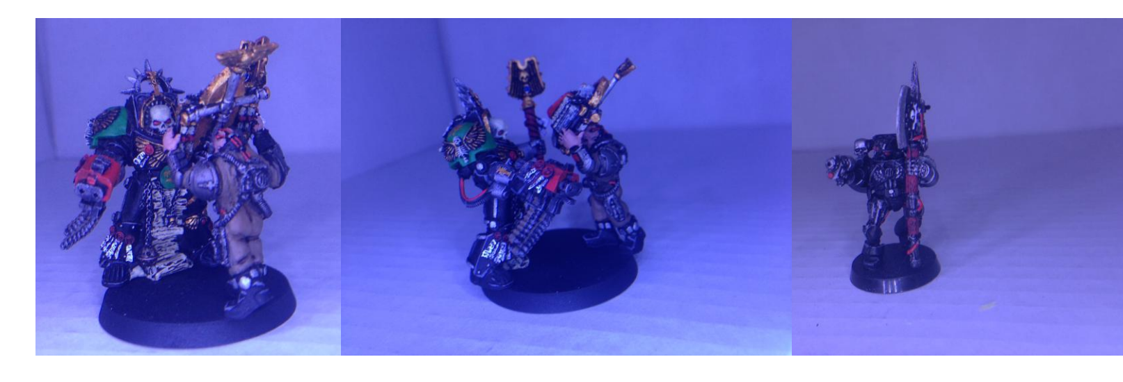
Deathwatch Chaplain of the Salamanders with Storm Bolter and Crozius