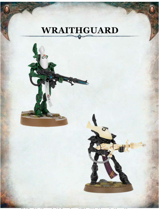
Biel-Tan Wraithguard with D-scythe and Ulthwé Wraithguard with wraithcannon